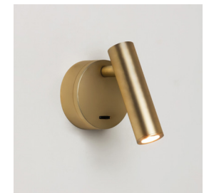
CODE: 1058108 (8481) FINISH: MATT GOLD