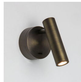
CODE: 1058084 (8258) FINISH: BRONZE