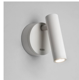
CODE: 1058015 (7359) FINISH: MATT WHITE