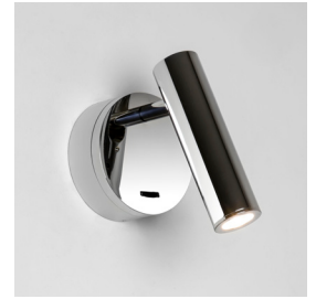
CODE: 1058014 (7358) FINISH: POLISHED CHROME