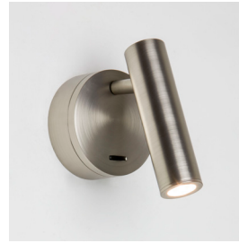
CODE: 1058013 (7357) FINISH: MATT NICKEL