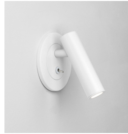
CODE: 1058062 FINISH: MATT WHITE