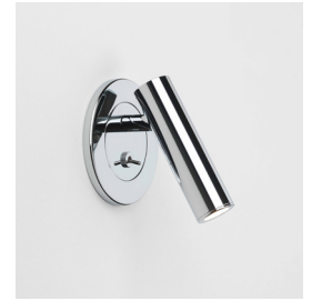
CODE: 1058064 FINISH: POLISHED CHROME