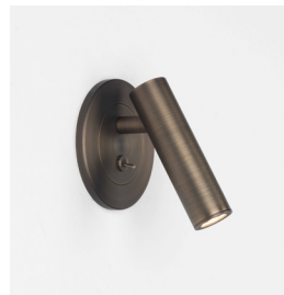
CODE: 1058088 FINISH: BRONZE

TO MAINTAIN THIS PRODUCT TO ITS BEST CONDITION, PLEASE VIEW OUR CARE AND CLEANING GUIDE ON THE SUPPORT SECTION OF THE ASTRO WEBSITE.