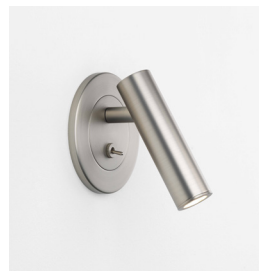
CODE: 1058065 FINISH: MATT NICKEL