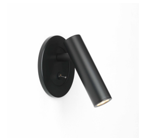
CODE: 1058067 FINISH: MATT BLACK