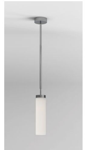
CODE: 1060007 (8523) FINISH: POLISHED CHROME

TO MAINTAIN THIS PRODUCT TO ITS BEST CONDITION, PLEASE VIEW OUR CARE AND CLEANING GUIDE ON THE SUPPORT SECTION OF THE ASTRO WEBSITE.