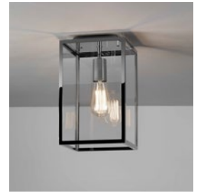
CODE: 1095022 FINISH: POLISHED NICKEL

TO MAINTAIN THIS PRODUCT TO ITS BEST CONDITION, PLEASE VIEW OUR CARE AND CLEANING GUIDE ON THE SUPPORT SECTION OF THE ASTRO WEBSITE.