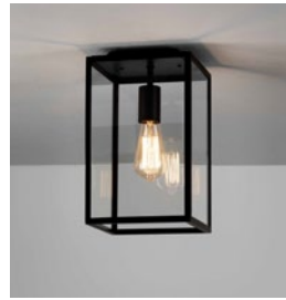
CODE: 1095021 FINISH: TEXTURED BLACK