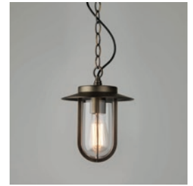
CODE: 1096010 FINISH: BRONZE

THIS PRODUCT IS NOT SUITABLE FOR INSTALLATION WITHIN FIVE MILES OF THE COAST. FOR THESE ENVIRONMENTS, PLEASE FILTER PRODUCTS ON THE ASTRO WEBSITE BY 'COASTAL'.