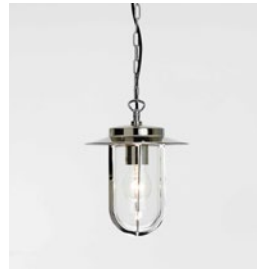
CODE: 1096004 FINISH: POLISHED NICKEL