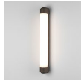
CODE: 1110010 (8046) FINISH: BRONZE

TO MAINTAIN THIS PRODUCT TO ITS BEST CONDITION, PLEASE VIEW OUR CARE AND CLEANING GUIDE ON THE SUPPORT SECTION OF THE ASTRO WEBSITE.