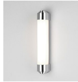
CODE: 1110007 (8043) FINISH: POLISHED CHROME