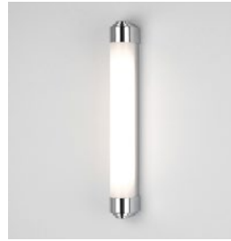
CODE: 1110008 (8044) FINISH: POLISHED CHROME