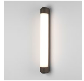
CODE: 1110010 (8046) FINISH: BRONZE

TO MAINTAIN THIS PRODUCT TO ITS BEST CONDITION, PLEASE VIEW OUR CARE AND CLEANING GUIDE ON THE SUPPORT SECTION OF THE ASTRO WEBSITE.