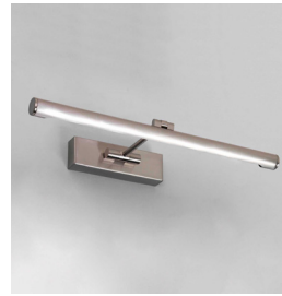
CODE: 1115009 FINISH: BRUSHED NICKEL