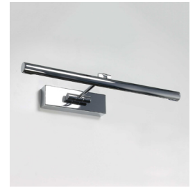
CODE: 1115010 FINISH: POLISHED CHROME