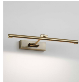
CODE: 1115013 FINISH: ANTIQUE BRASS

TO MAINTAIN THIS PRODUCT TO ITS BEST CONDITION, PLEASE VIEW OUR CARE AND CLEANING GUIDE ON THE SUPPORT SECTION OF THE ASTRO WEBSITE.