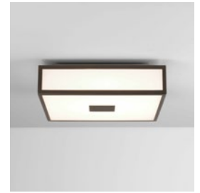
CODE: 1121044 FINISH: BRONZE