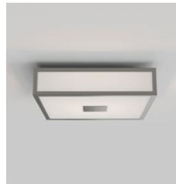
CODE: 1121071 FINISH: MATT NICKEL

TO MAINTAIN THIS PRODUCT TO ITS BEST CONDITION, PLEASE VIEW OUR CARE AND CLEANING GUIDE ON THE SUPPORT SECTION OF THE ASTRO WEBSITE.