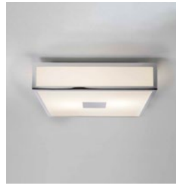
CODE: 1121040 FINISH: POLISHED CHROME