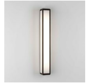
CODE: 1121058 (8291) FINISH: BRONZE

THIS PRODUCT IS SUITABLE FOR ONEROUS ENVIRONMENTS AND CAN BE INSTALLED WITHIN FIVE MILES OF THE COAST - THREE YEAR WARRANTY APPLIES.