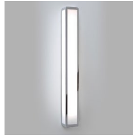
CODE: 1121020 (7134) FINISH: POLISHED CHROME