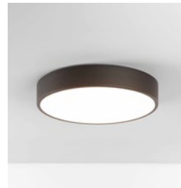
CODE: 1125006 FINISH: BRONZE

TO MAINTAIN THIS PRODUCT TO ITS BEST CONDITION, PLEASE VIEW OUR CARE AND CLEANING GUIDE ON THE SUPPORT SECTION OF THE ASTRO WEBSITE.