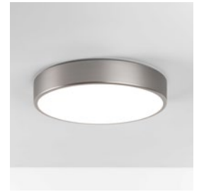
CODE: 1125005 FINISH: MATT NICKEL