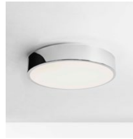
CODE: 1125004 FINISH: POLISHED CHROME