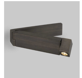
CODE: 1157012 (8223) FINISH: BRONZE

TO MAINTAIN THIS PRODUCT TO ITS BEST CONDITION, PLEASE VIEW OUR CARE AND CLEANING GUIDE ON THE SUPPORT SECTION OF THE ASTRO WEBSITE.