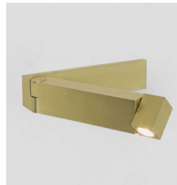
CODE: 1157007 (7548) FINISH: MATT GOLD