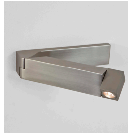
CODE: 1157001 (0699) FINISH: MATT NICKEL