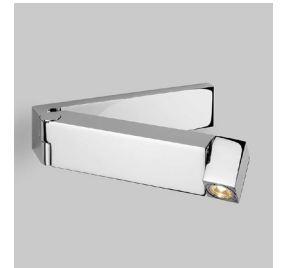
CODE: 1157003 (0850) FINISH: POLISHED CHROME