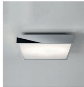
CODE: 1169016 FINISH: POLISHED CHROME