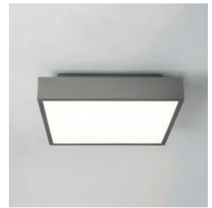
CODE: 1169017 FINISH: MATT NICKEL

TO MAINTAIN THIS PRODUCT TO ITS BEST CONDITION, PLEASE VIEW OUR CARE AND CLEANING GUIDE ON THE SUPPORT SECTION OF THE ASTRO WEBSITE.