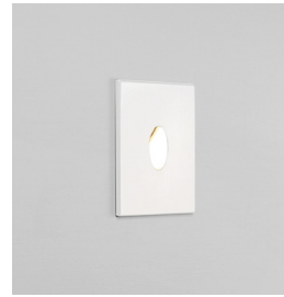
CODE: 1175006 FINISH: MATT WHITE