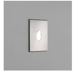
CODE: 1175007 FINISH: BRUSHED STAINLESS STEEL