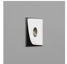
CODE: 1175010 FINISH: POLISHED STAINLESS STEEL

TO MAINTAIN THIS PRODUCT TO ITS BEST CONDITION, PLEASE VIEW OUR CARE AND CLEANING GUIDE ON THE SUPPORT SECTION OF THE ASTRO WEBSITE.