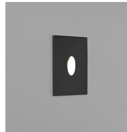
CODE: 1175009 FINISH: TEXTURED BLACK