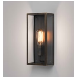
CODE: 1183018 FINISH: BRONZE

THIS PRODUCT IS NOT SUITABLE FOR INSTALLATION WITHIN FIVE MILES OF THE COAST. FOR THESE ENVIRONMENTS, PLEASE FILTER PRODUCTS ON THE ASTRO WEBSITE BY 'COASTAL'.