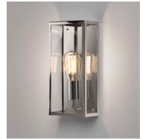
CODE: 1183006 FINISH: POLISHED NICKEL