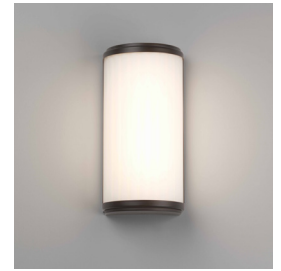
CODE: 1194019 FINISH: BRONZE

TO MAINTAIN THIS PRODUCT TO ITS BEST CONDITION, PLEASE VIEW OUR CARE AND CLEANING GUIDE ON THE SUPPORT SECTION OF THE ASTRO WEBSITE.