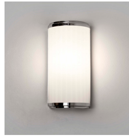
CODE: 1194017 FINISH: POLISHED CHROME