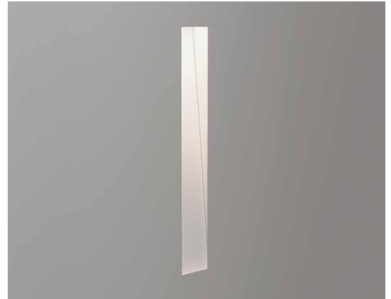
CODE: 1212040 FINISH: MATT WHITE

TO MAINTAIN THIS PRODUCT TO ITS BEST CONDITION, PLEASE VIEW OUR CARE AND CLEANING GUIDE ON THE SUPPORT SECTION OF THE ASTRO WEBSITE.