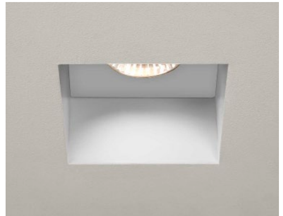
CODE: 1248005 (5670) FINISH: MATT WHITE

TO MAINTAIN THIS PRODUCT TO ITS BEST CONDITION, PLEASE VIEW OUR CARE AND CLEANING GUIDE ON THE SUPPORT SECTION OF THE ASTRO WEBSITE.