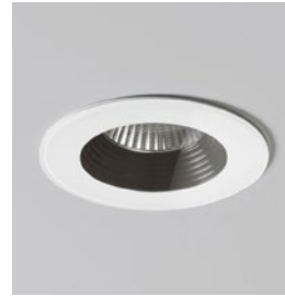
CODE: 1254013 FINISH: WHITE