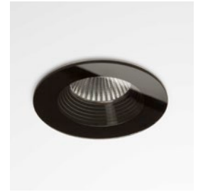
CODE: 1254016 FINISH: BLACK

TO MAINTAIN THIS PRODUCT TO ITS BEST CONDITION, PLEASE VIEW OUR CARE AND CLEANING GUIDE ON THE SUPPORT SECTION OF THE ASTRO WEBSITE.