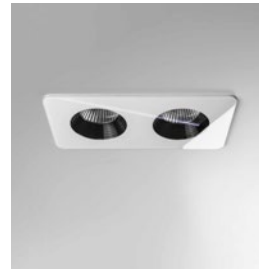
CODE: 1254015 FINISH: WHITE