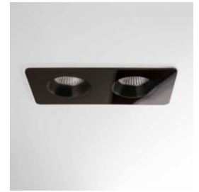
CODE: 1254018 FINISH: BLACK

TO MAINTAIN THIS PRODUCT TO ITS BEST CONDITION, PLEASE VIEW OUR CARE AND CLEANING GUIDE ON THE SUPPORT SECTION OF THE ASTRO WEBSITE.