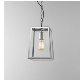
CODE: 1306014 FINISH: POLISHED NICKEL

THIS PRODUCT IS NOT SUITABLE FOR INSTALLATION WITHIN FIVE MILES OF THE COAST. FOR THESE ENVIRONMENTS, PLEASE FILTER PRODUCTS ON THE ASTRO WEBSITE BY 'COASTAL'.