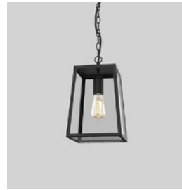
CODE: 1306013 FINISH: TEXTURED BLACK