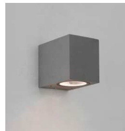
CODE: 1310007 (8195) FINISH: TEXTURED GREY

THIS PRODUCT IS SUITABLE FOR ONEROUS ENVIRONMENTS AND CAN BE INSTALLED WITHIN FIVE MILES OF THE COAST – THREE YEAR WARRANTY APPLIES.