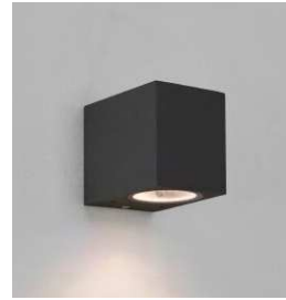
CODE: 1310002 (7126) FINISH: TEXTURED BLACK