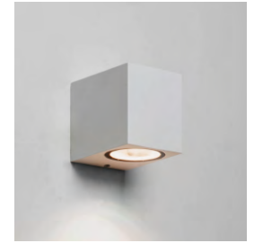
CODE: 1310005 (7564) FINISH: TEXTURED WHITE