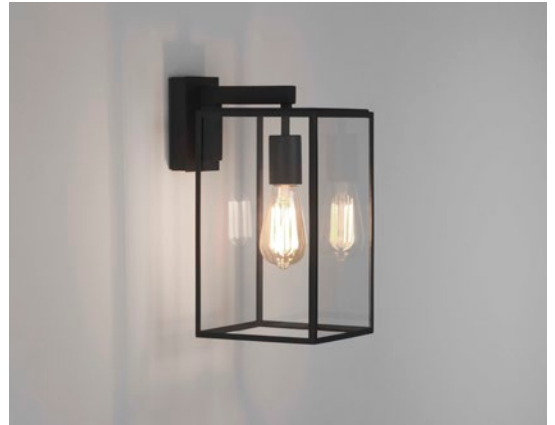
CODE: 1354004 FINISH: TEXTURED BLACK

TO MAINTAIN THIS PRODUCT TO ITS BEST CONDITION, PLEASE VIEW OUR CARE AND CLEANING GUIDE ON THE SUPPORT SECTION OF THE ASTRO WEBSITE.