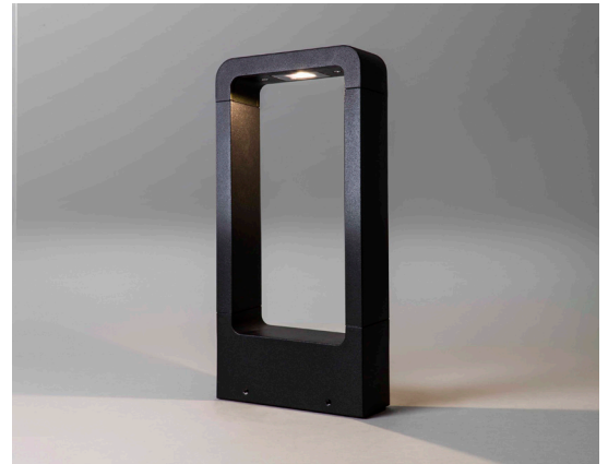
CODE: 1357005 FINISH: TEXTURED BLACK

TO MAINTAIN THIS PRODUCT TO ITS BEST CONDITION, PLEASE VIEW OUR CARE AND CLEANING GUIDE ON THE SUPPORT SECTION OF THE ASTRO WEBSITE.