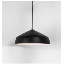
CODE: 1361002 FINISH: MATT BLACK