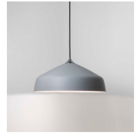
CODE: 1361004 FINISH: LIGHT GREY