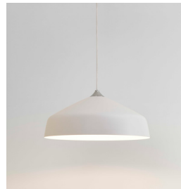
CODE: 1361012 FINISH: MATT WHITE

TO MAINTAIN THIS PRODUCT TO ITS BEST CONDITION, PLEASE VIEW OUR CARE AND CLEANING GUIDE ON THE SUPPORT SECTION OF THE ASTRO WEBSITE.