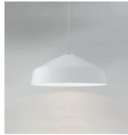
CODE: 1361013 (8572) FINISH: MATT WHITE