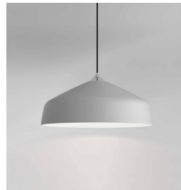
CODE: 1361015 (8574) FINISH: LIGHT GREY

TO MAINTAIN THIS PRODUCT TO ITS BEST CONDITION, PLEASE VIEW OUR CARE AND CLEANING GUIDE ON THE SUPPORT SECTION OF THE ASTRO WEBSITE.