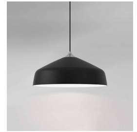
CODE: 1361014 (8573) FINISH: MATT BLACK