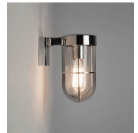
CODE: 1368004 (7560) FINISH: POLISHED NICKEL