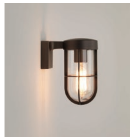
CODE: 1368025 (8275) FINISH: BRONZE

THIS PRODUCT IS NOT SUITABLE FOR INSTALLATION WITHIN FIVE MILES OF THE COAST. FOR THESE ENVIRONMENTS, PLEASE FILTER PRODUCTS ON THE ASTRO WEBSITE BY 'COASTAL'.