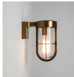
CODE: 1368003 (7559) FINISH: ANTIQUE BRASS