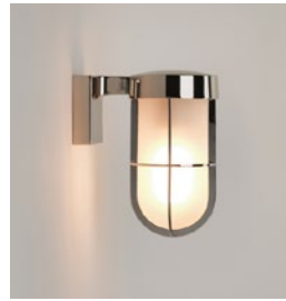
CODE: 1368006 FINISH: POLISHED NICKEL