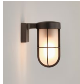
CODE: 1368026 FINISH: BRONZE

TO MAINTAIN THIS PRODUCT TO ITS BEST CONDITION, PLEASE VIEW OUR CARE AND CLEANING GUIDE ON THE SUPPORT SECTION OF THE ASTRO WEBSITE.