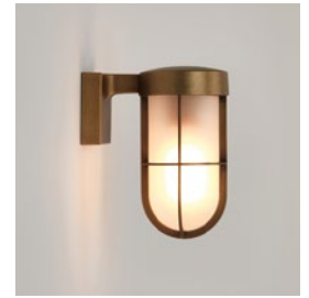
CODE: 1368008 FINISH: ANTIQUE BRASS