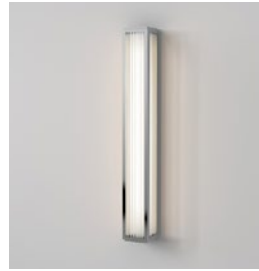
CODE: 1370003 (8329) FINISH: POLISHED CHROME