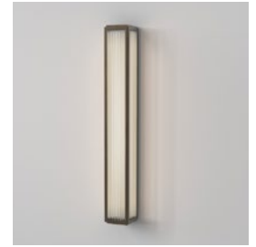
CODE: 1370005 (8331) FINISH: BRONZE

TO MAINTAIN THIS PRODUCT TO ITS BEST CONDITION, PLEASE VIEW OUR CARE AND CLEANING GUIDE ON THE SUPPORT SECTION OF THE ASTRO WEBSITE.