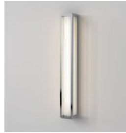
CODE: 1370003 (8329) FINISH: POLISHED CHROME