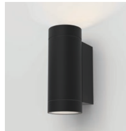
CODE: 1372014 FINISH: TEXTURED BLACK

THIS PRODUCT IS SUITABLE FOR ONEROUS ENVIRONMENTS AND CAN BE INSTALLED WITHIN FIVE MILES OF THE COAST - THREE YEAR WARRANTY APPLIES.