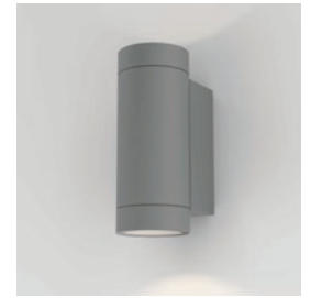
CODE: 1372013 FINISH: TEXTURED GREY