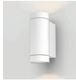
CODE: 1372012 FINISH: TEXTURED WHITE