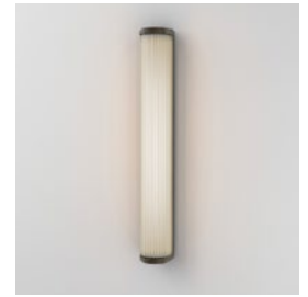
CODE: 1380012 (8483) FINISH: BRONZE

TO MAINTAIN THIS PRODUCT TO ITS BEST CONDITION, PLEASE VIEW OUR CARE AND CLEANING GUIDE ON THE SUPPORT SECTION OF THE ASTRO WEBSITE.