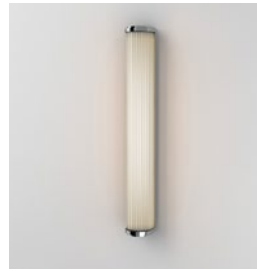
CODE: 1380011 (8482) FINISH: POLISHED CHROME