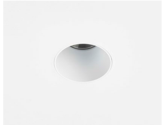
CODE: 1392001 FINISH: MATT WHITE

TO MAINTAIN THIS PRODUCT TO ITS BEST CONDITION, PLEASE VIEW OUR CARE AND CLEANING GUIDE ON THE SUPPORT SECTION OF THE ASTRO WEBSITE.