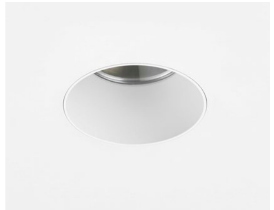
CODE: 1392005 FINISH: MATT WHITE

TO MAINTAIN THIS PRODUCT TO ITS BEST CONDITION, PLEASE VIEW OUR CARE AND CLEANING GUIDE ON THE SUPPORT SECTION OF THE ASTRO WEBSITE.