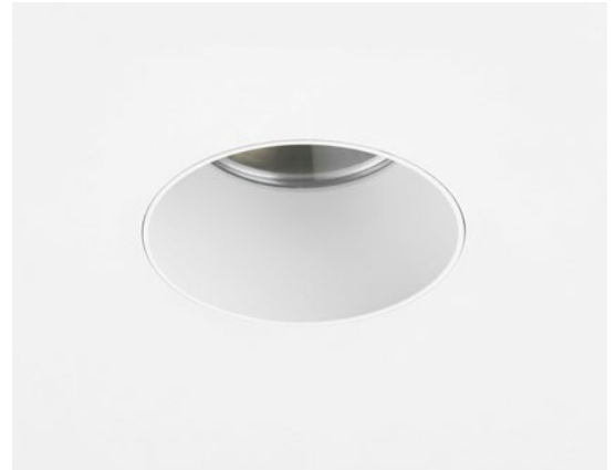
CODE: 1392008 FINISH: MATT WHITE

TO MAINTAIN THIS PRODUCT TO ITS BEST CONDITION, PLEASE VIEW OUR CARE AND CLEANING GUIDE ON THE SUPPORT SECTION OF THE ASTRO WEBSITE.