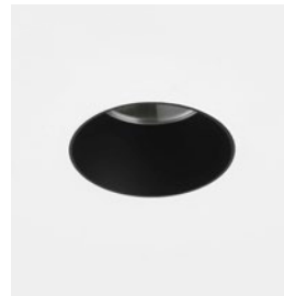
CODE: 1392016 FINISH: MATT BLACK