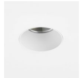
CODE: 1392019 FINISH: MATT WHITE

TO MAINTAIN THIS PRODUCT TO ITS BEST CONDITION, PLEASE VIEW OUR CARE AND CLEANING GUIDE ON THE SUPPORT SECTION OF THE ASTRO WEBSITE.