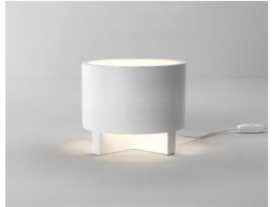
CODE: 1395002 (8300) FINISH: PLASTER

TO MAINTAIN THIS PRODUCT TO ITS BEST CONDITION, PLEASE VIEW OUR CARE AND CLEANING GUIDE ON THE SUPPORT SECTION OF THE ASTRO WEBSITE.