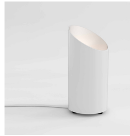
CODE: 1412001 FINISH: MATT WHITE