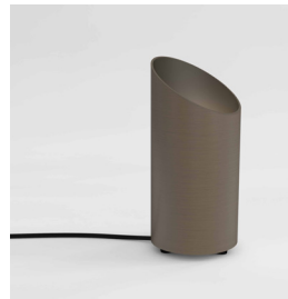
CODE: 1412003 FINISH: BRONZE

TO MAINTAIN THIS PRODUCT TO ITS BEST CONDITION, PLEASE VIEW OUR CARE AND CLEANING GUIDE ON THE SUPPORT SECTION OF THE ASTRO WEBSITE.