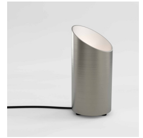
CODE: 1412002 FINISH: MATT NICKEL