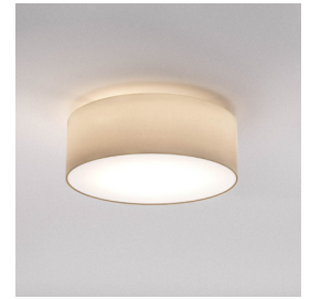
CODE: 1421002 FINISH: PUTTY FABRIC