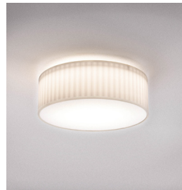
CODE: 1421003 FINISH: WHITE PLEATED

TO MAINTAIN THIS PRODUCT TO ITS BEST CONDITION, PLEASE VIEW OUR CARE AND CLEANING GUIDE ON THE SUPPORT SECTION OF THE ASTRO WEBSITE.