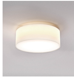
CODE: 1421001 FINISH: WHITE FABRIC