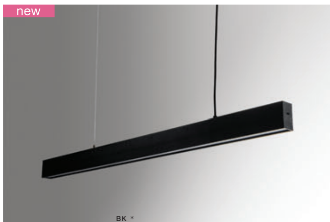
LINNEA 112 PENDANT CCT