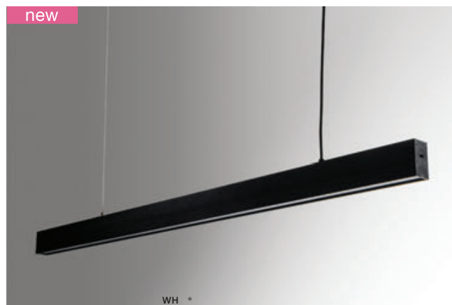
LINNEA 140 PENDANT CCT