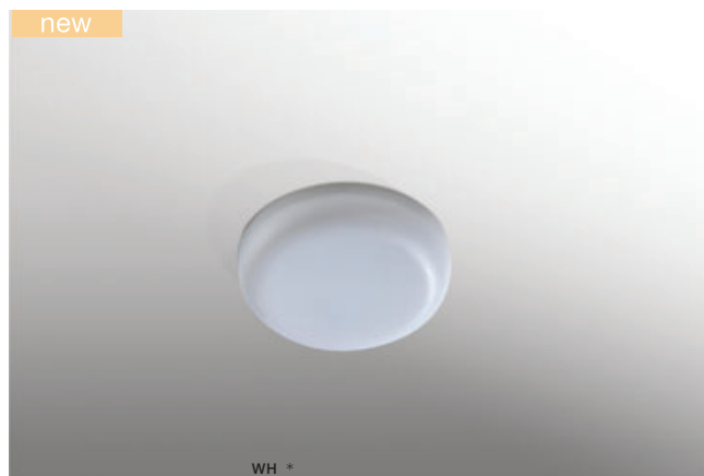
LAMIR R 12 IP44 3000K / 4000K