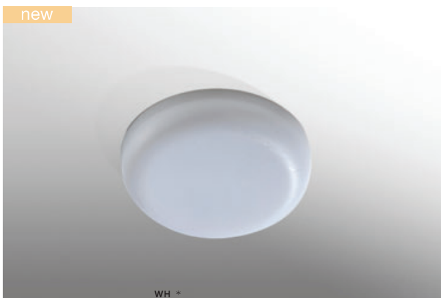
LAMIR R 17 DIMM IP44 3000K / 4000K