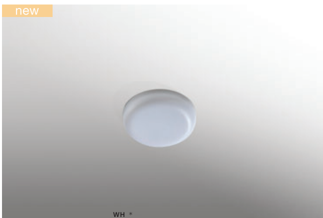
LAMIR R 9 IP44 3000K / 4000K