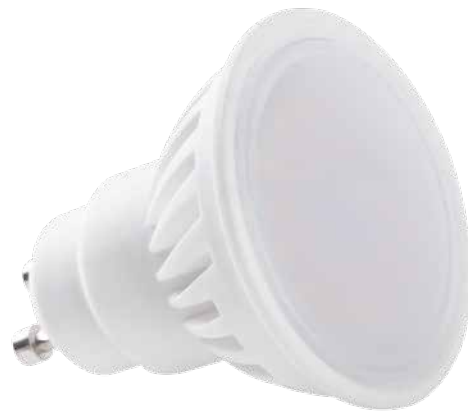
TEDI MAX LED GU10-CW