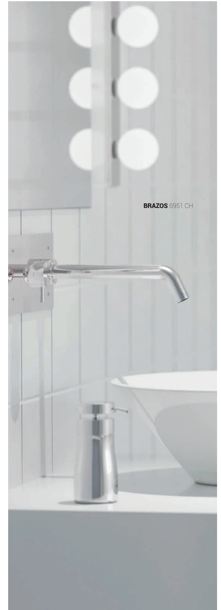
BRAZOS 6951 CH