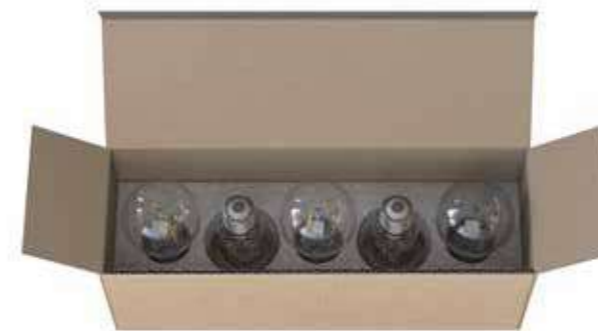
5 PC SET