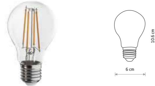
BULB LED E27, A60, 7W glass