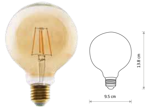
BULB VINTAGE LED E27, 6W glass