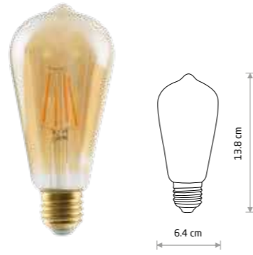
BULB VINTAGE LED E27, 6W glass