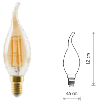
BULB VINTAGE LED E14, 6W glass