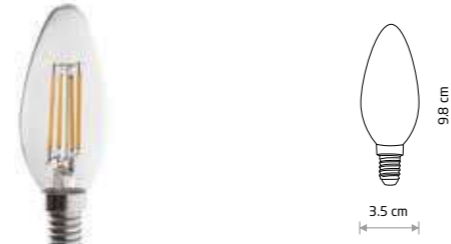
BULB LED E14, C35, 6W glass