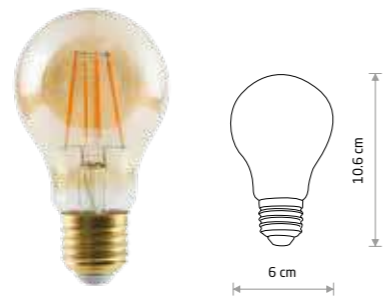
BULB VINTAGE LED E27, 6W glass