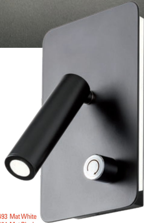
art. 01-1493 Mat White art. 01-1494 Mat Black