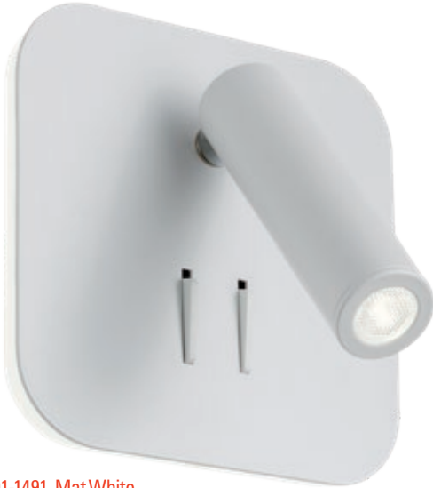
art. 01-1491 Mat White art. 01-1492 Mat Black